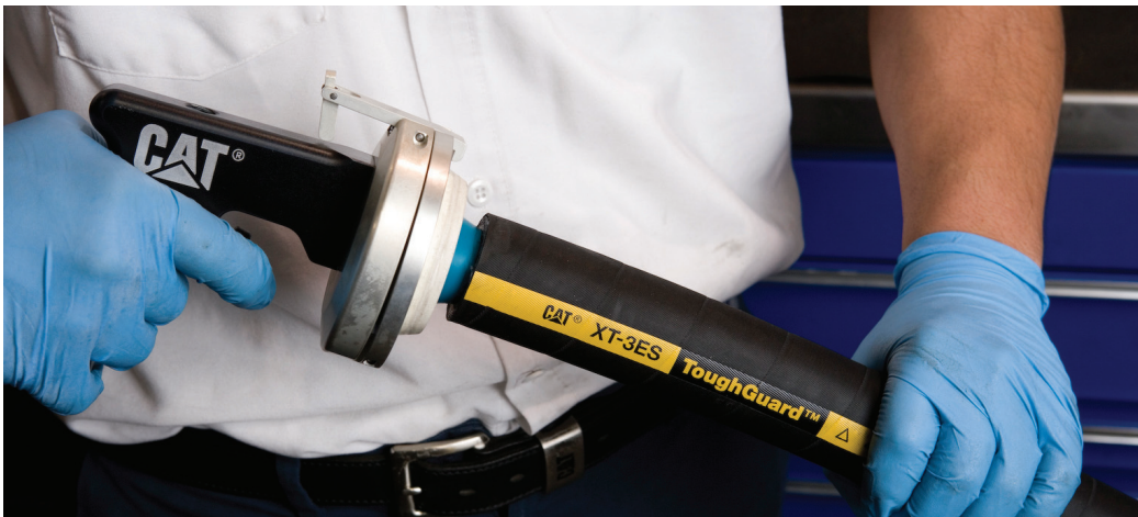
Barloworld Equipment pneumatically clean hoses with foam projectiles to remove contaminants that can damage hydraulic system components.

Cat dealers use a state-of-the-art process to remove contaminants created during the cutting and crimping of hoses. If left inside hoses, these contaminants can damage cylinders, pumps and other hydraulic system components. Barloworld Equipment also cap the ends of hoses to help prevent contaminant ingress prior to installation.